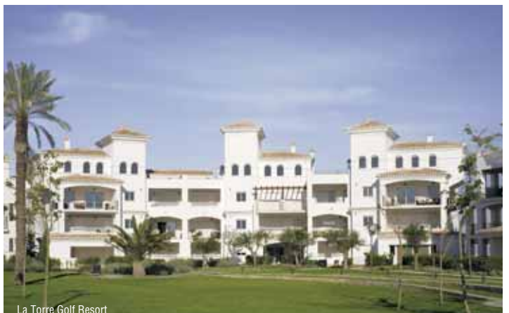
La Torre Golf Resort